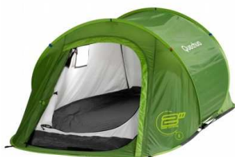
Patent. Applic. Pending. FR, GB, DE, ES, IT, PT, US, VT, CN, HK, RU, BR, JP, CA, AU, ZA, NL, NZ, NO